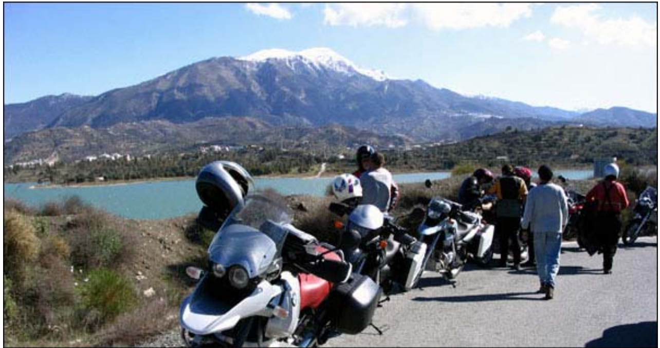
En route to Ronda.