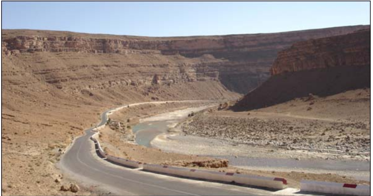
Canyon of Ziz