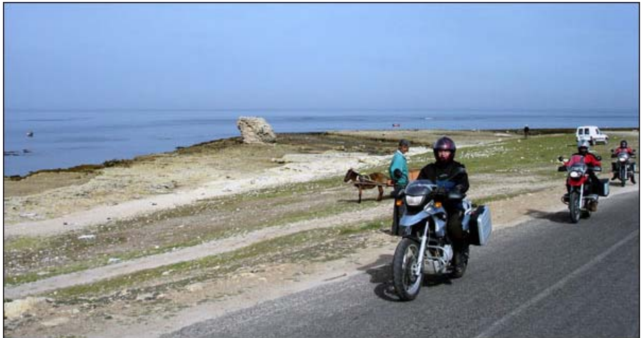
South along the Atlantic