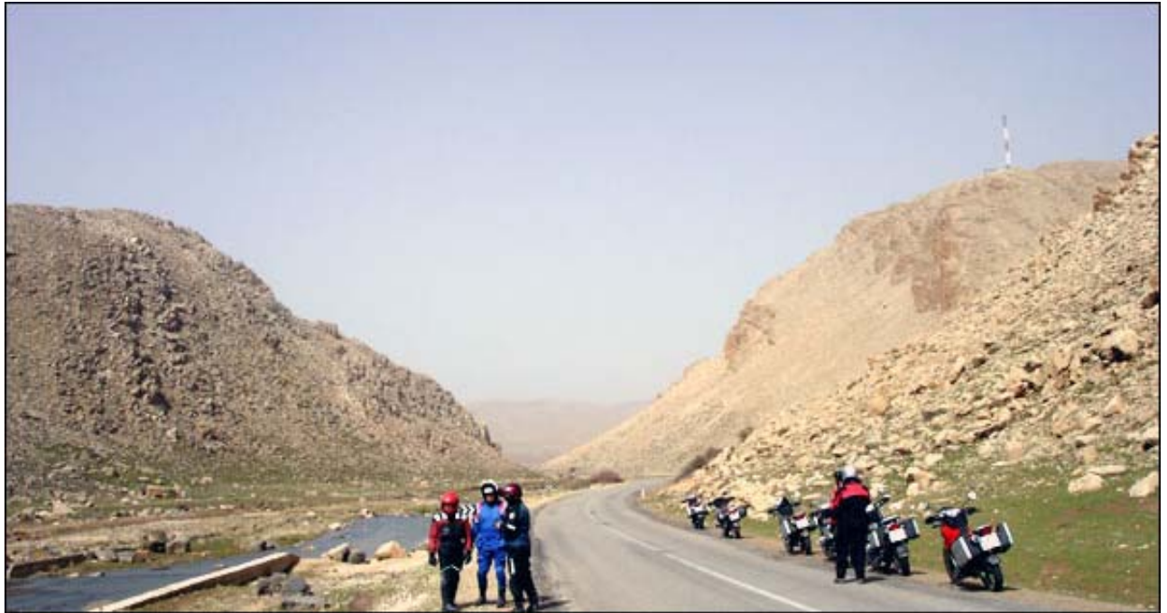
Through the "Middle Atlas"