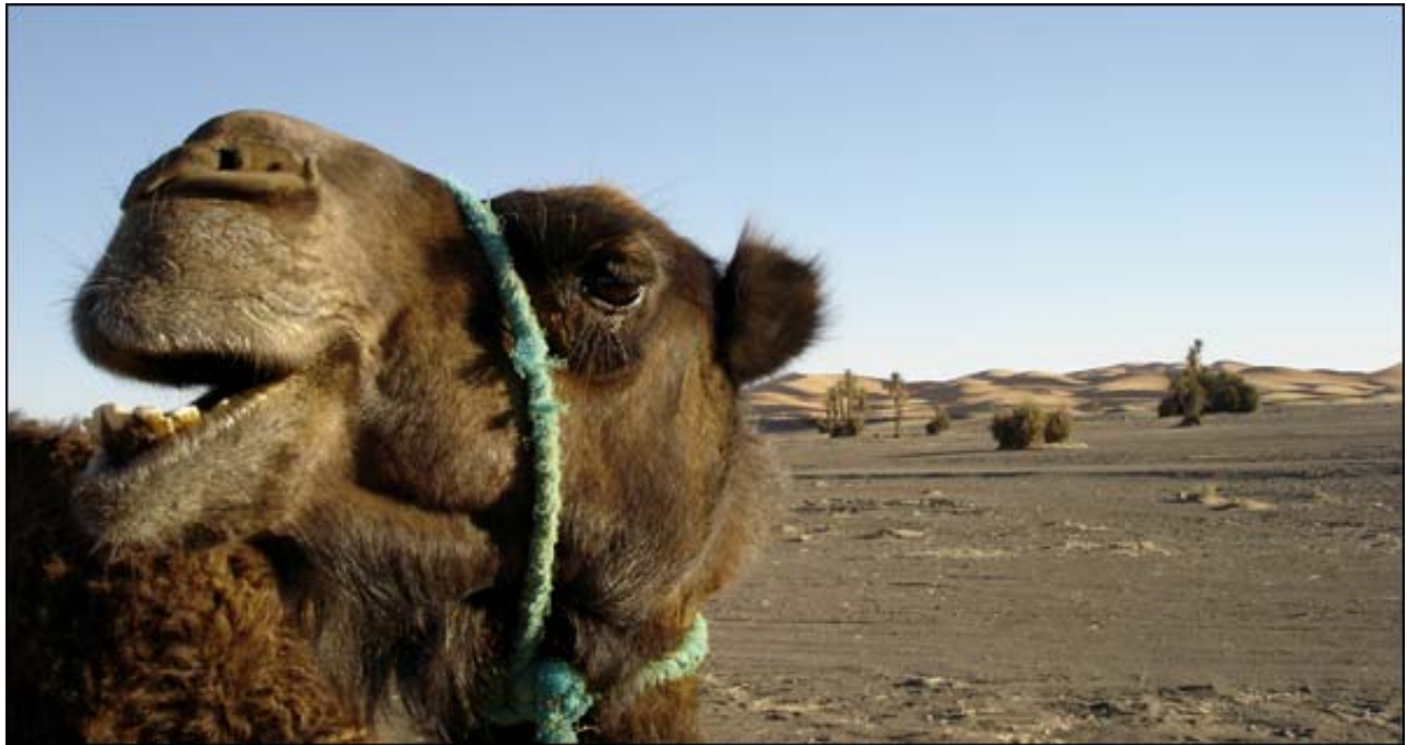
"Jimmy Hendrix" ready to ride out.