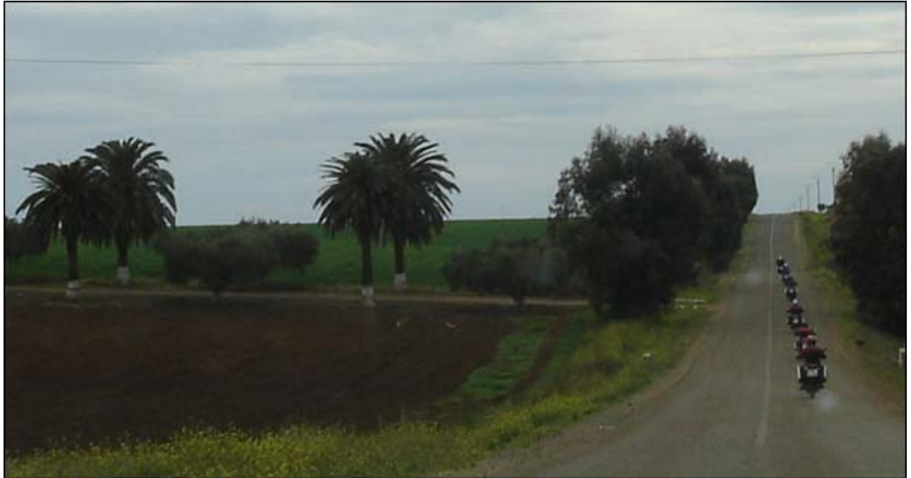
On our way to Marrakech