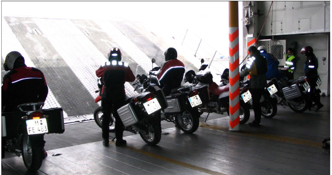
Off to Morocco!