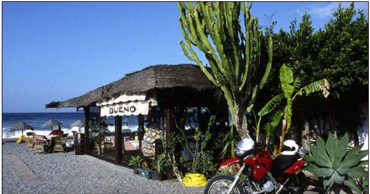
La Herradura beach