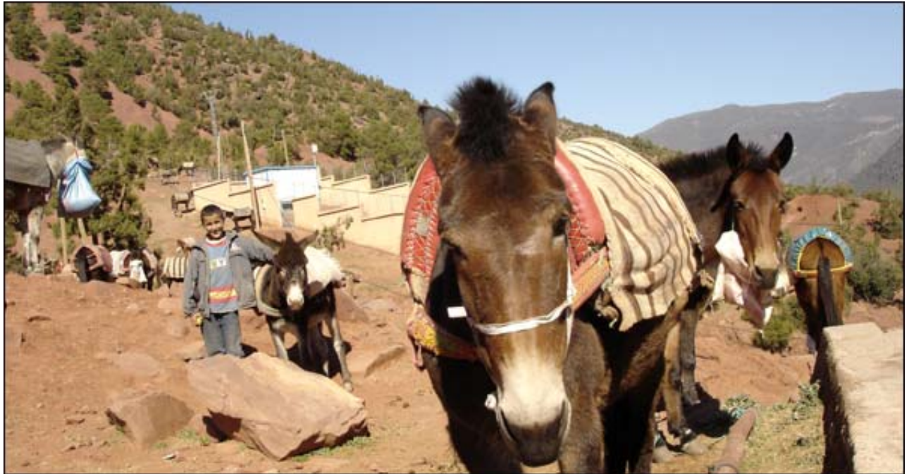
In the North