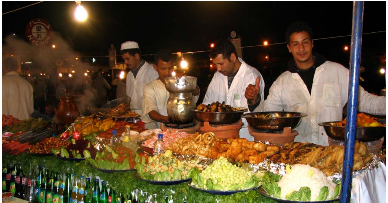
At the Djemaa el-Fna