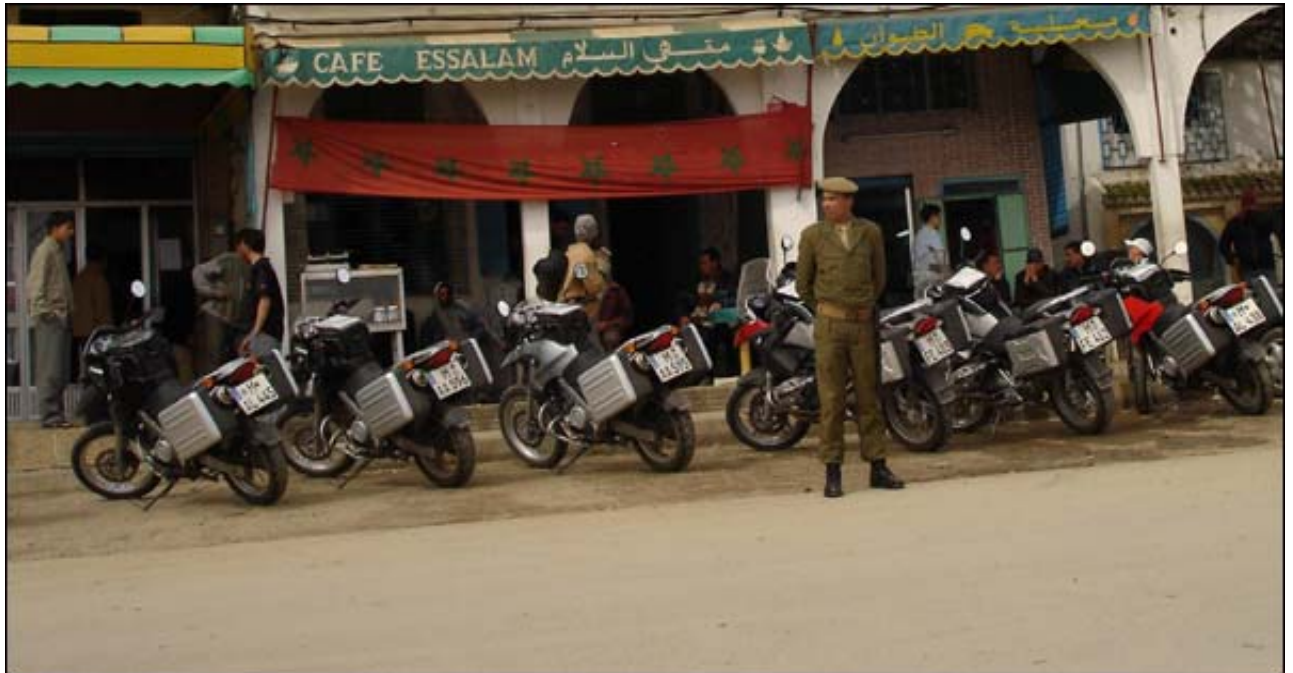
In the Rif mountains