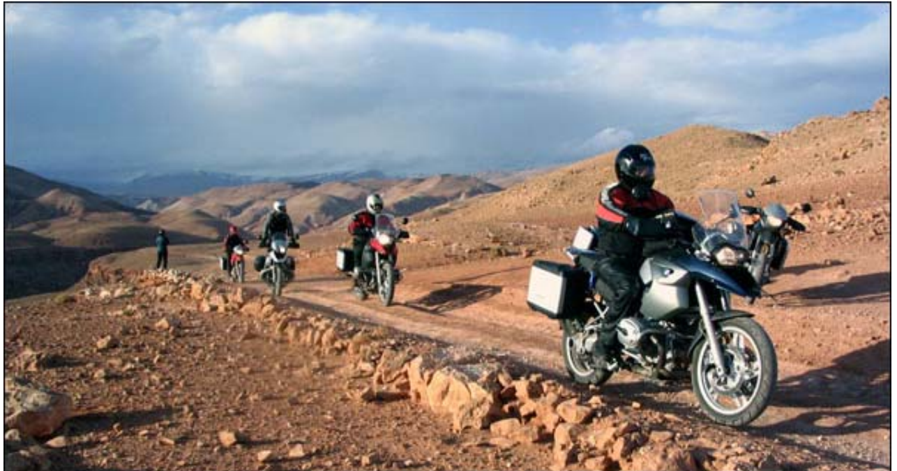
Asphalt or no asphalt; today that is the question!